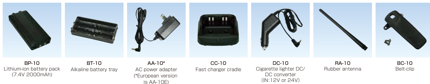
BP-10 Lithium-ion battery pack (7.4V 2000mAh)